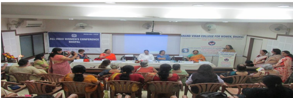
National Seminar on "Gender Equality and Feminist Perspective in modern ERA"