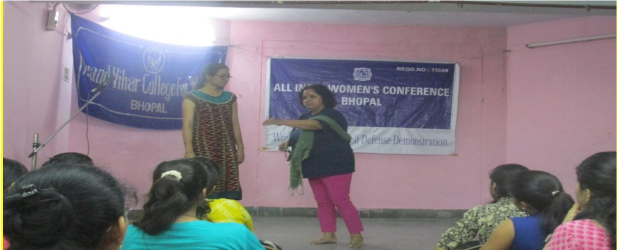
Women safety and self defense Demonstration awareness