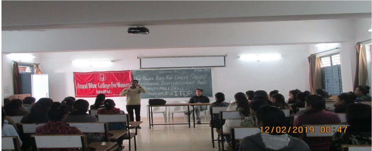
Seminar by ITDP The Power Plan For Career Success: Exploring self employment transferable skills