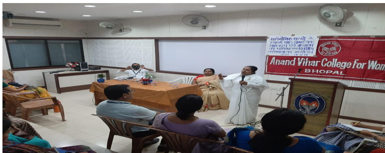
Workshop on "Role of social cohesion, spirituality and peace in agumentation of universal values" by IGNOU and Brahmakumari university