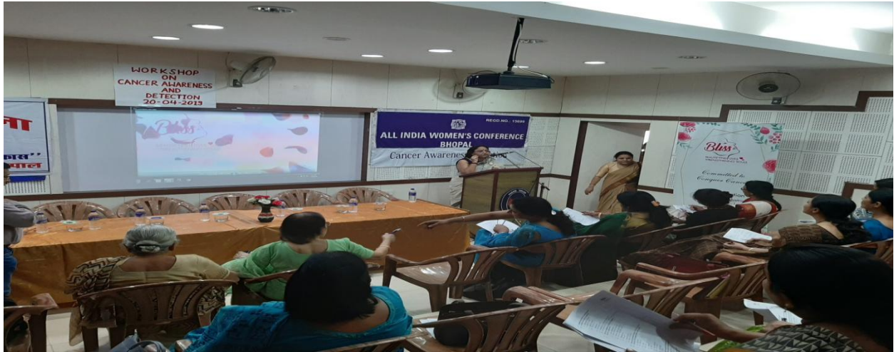
Cancer awareness and detection programme by AIWC and BLISS foundation