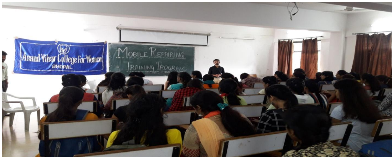
A workshop of 60 hours on mobile repairing