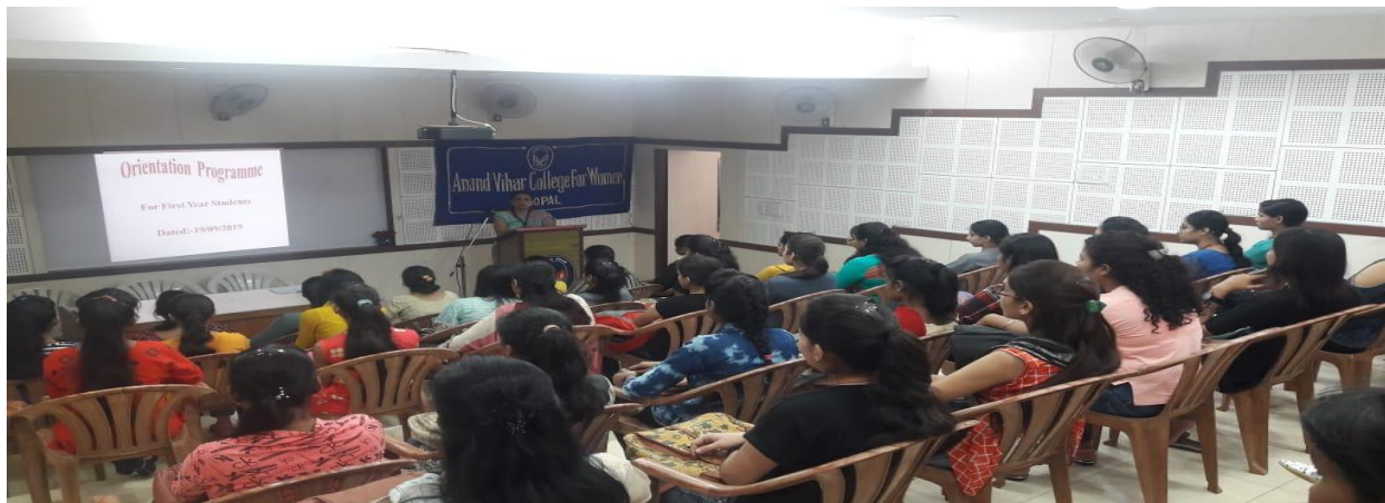
Orientation Programme for Freshers