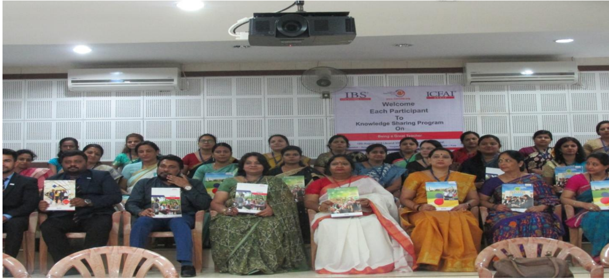
FKSP on being a great teacher by IBS