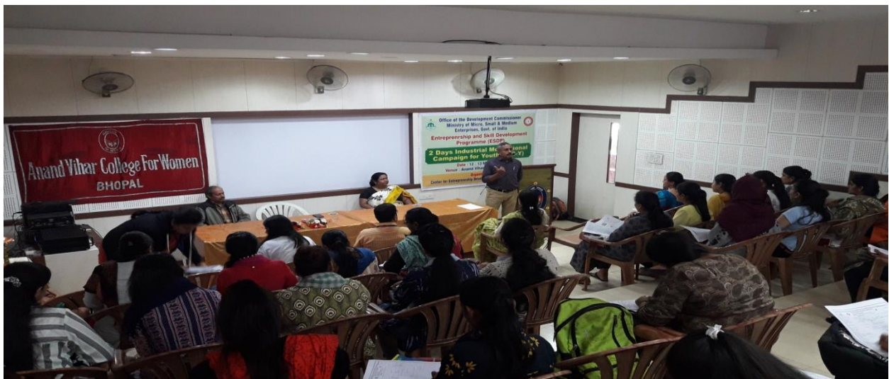
Industrial Motivation Camp by CEDMAP