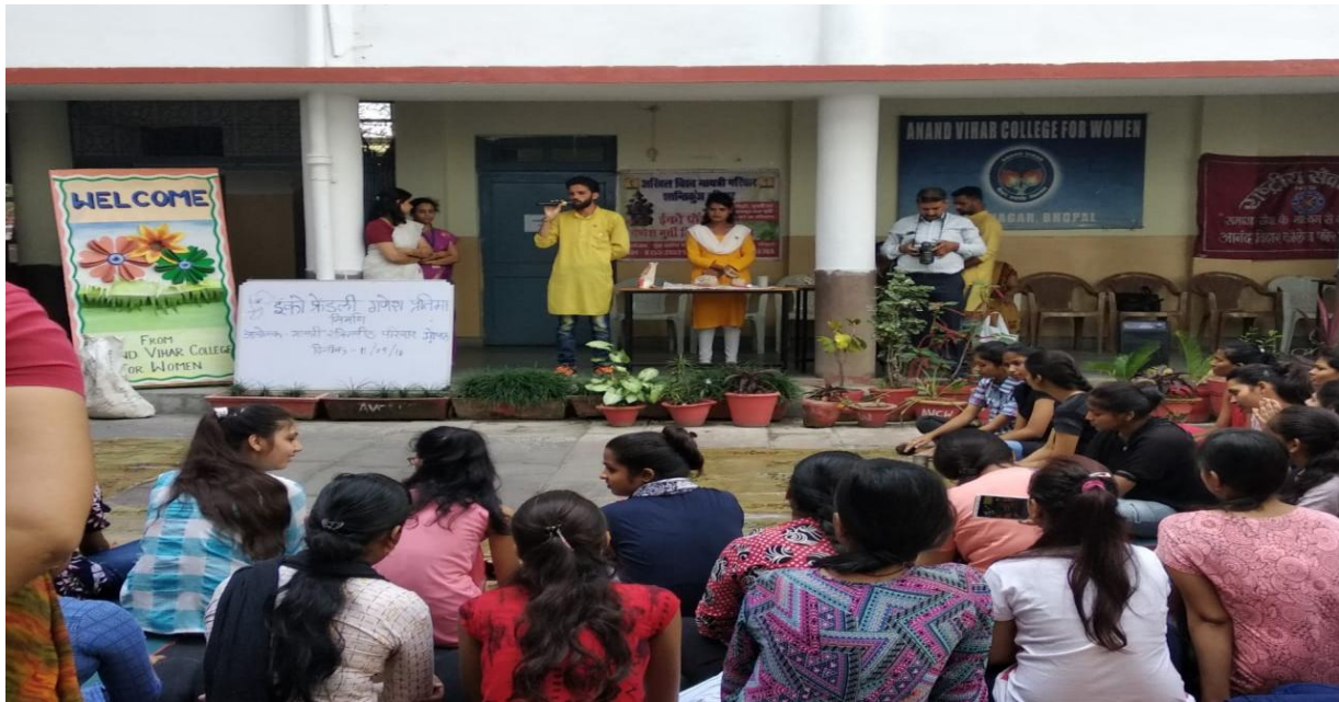
Workshop on preparing Eco friendly Ganesha by Gayatri Shakti Peeth