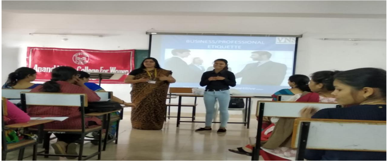
Seminar on Career counseling including Business Etiquettes by VNS