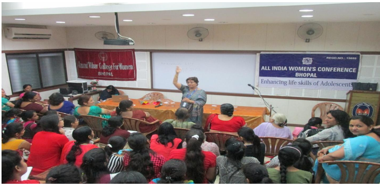
Workshop on enhancement of life skill organized by All India Women Conference 13 Oct 2018 to 18 Oct 2018