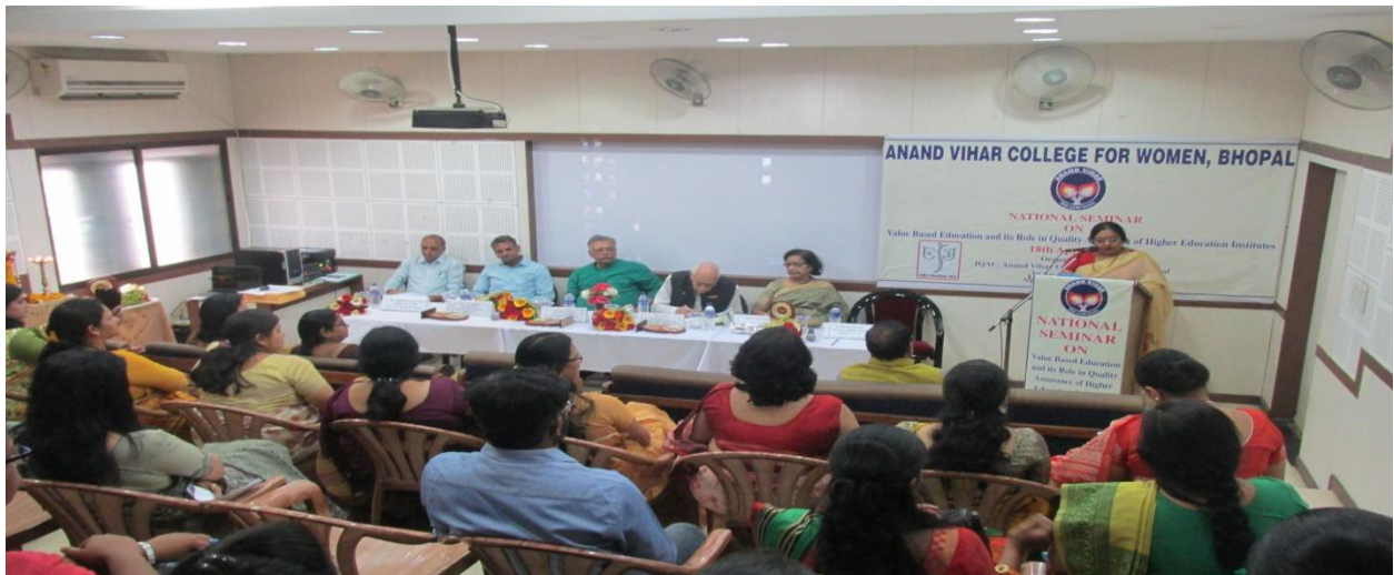
National Seminar on Value Based Education and its Role in Quality Assurance of Higher Education Institute .